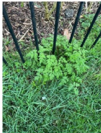
Overgrown with weeds.